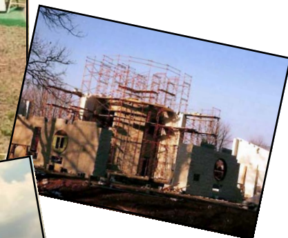
Views of the construction and the near completion