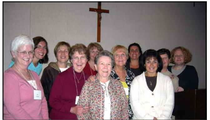
Cornerstone committee members and presenters

Cornerstone provided an opportunity for all to reflect on their lives, their spiritual journey and to share with other women in the parish. One of the highlights was that each women was presented with a white 8 by 8 inch cloth square to decorate their reflection and feelings. The squares were then assembled into a quilt with each of the women attaching their own. The finished product, displayed in the Atrium, was outstanding and a unique and spiritual experience was felt by all.