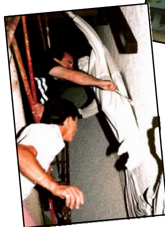
Dedicated parishioners working to finish details